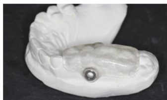
Fig. 2. Acrylic surgical, bucal view