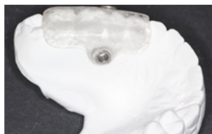
Fig 3. Acrylic surgical, oral view