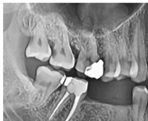
Fig.4. Pre treatment periapical view