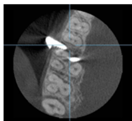
Fig. 6. CBCT view : post insertion