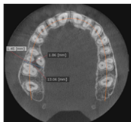
Fig. 5. CBCT view : interradicular space is 1.45- 1.86 mm