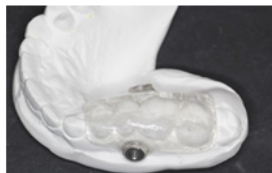
Fig. 1. Acrylic resin surgical guide

Another partial CBCT was carried out to evaluate the position of the inserted mini-implants.